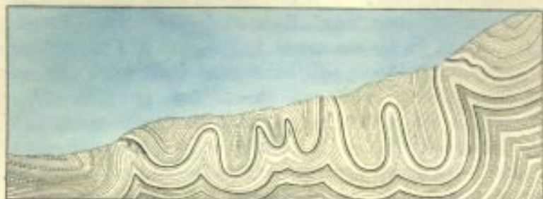
Fig. 1. Slates of Bull Crag and Maiden Moor.