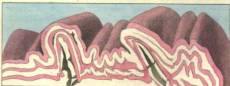
Fig. 3. Pie-Paste. Compression modified by elevatory forces.